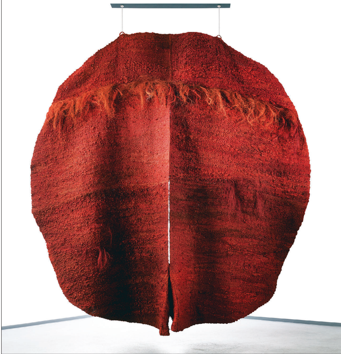
MAGDALENA ABAKANOWICZ (Poland) Abakan Rouge III Sisal, tapestry techniques; 118.1" x 118.1" x 17.7", 1970–1971.

participate in the first Lausanne Biennial . She became the central figure in the new departure that took place in Europe.