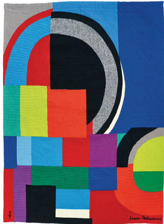
SONIA DELAUNAY (Ukraine/ France) La Courbe Grise Wool, tapestry techniques, 53" x 72"; 1970–1972.

The public was present in large numbers again and was as enthusiastic as during the original Biennial events. Asked for new plans in the realm of textile art, both the director of the Fine Art Museum and the Cultural Representative of the State of Vaud were very positive. But they are waiting for the new museum building "Pôle muséal", planned for 2019, where the Toms Pauli Foundation and the Fine Art museum will be in the same building. Curator Giselle Eberhard Cotton is planning a detailed catalogue book on the history of the Lausanne Tapestry Biennial to be published in 2017. Many images of Biennial works are published on their website. 6