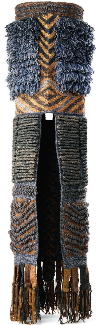
LEFT: AURELIA MUÑOZ (Spain) Capa pluvial II 98.4" x 78.7", 1976. RIGHT: JAGODA BUIĆ (Croatia) Flexion II Wool, sisal, gold metallic wire, tapestry techniques, 64.9" x 33" x 25.1", 1971.

Eastern European women artists who presented revolutionary one-offs at the Biennials . 2