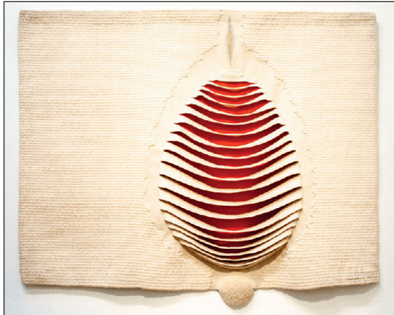
PIERRE DAQUIN (France) Devenant Wool, gold thread, tapestry, 47.2" x 76.7", 1968. Collection Fondation Toms Pauli, Lausanne.

on what was considered fine art to reassess the role of soft pliable textile and fiber material in contemporary art in an effort to get textile art out of its ghetto. It is ironic that the statement "The artists are worn out" was made at the exact time when the new digital weaving revolution began, followed by the revolution of new "smart materials" and techniques, such as 3D printing. An article in Textile Forum magazine on the subject is worth reading. 5